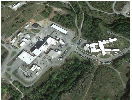
Figure 2: FMC and Albemarle Lithium Processing Facilities

The region is one of the premier localities in the world to be exploring for lithium pegmatites given its favourable geology and ideal location with easy access to infrastructure, power, R&D centres for lithium and battery storage, major high tech population centres and downstream lithium processing facilities. The Company is in a unique position to leverage its position as a first mover in restarting exploration in this historic lithium producing region with the aim of developing a strategic, U.S. domestic source of lithium to supply the increasing electric vehicle and battery storage markets.